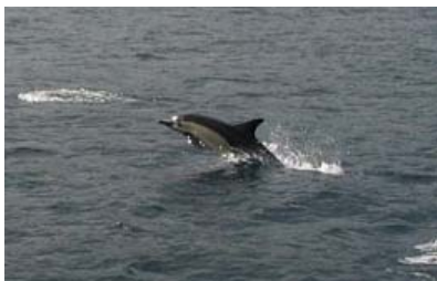
Catalina Photos courtesy of Cherri Cubillos